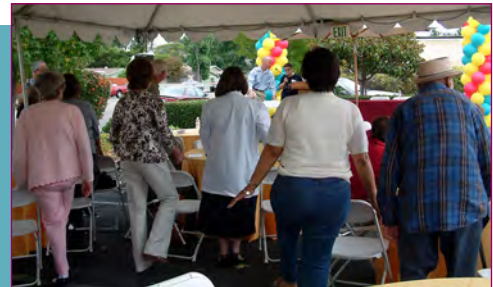
Older adults learn how to exercise after lunch at the Open House for our Grand Avenue Adult Health Center in Escondido

Everybody wants to feel good, to constantly experience a wonderful vibrant, healthy sensation in body and mind. But consistently feeling good involves more than taking an aspirin for a headache, or seeing your doctor when a serious health problem arises.